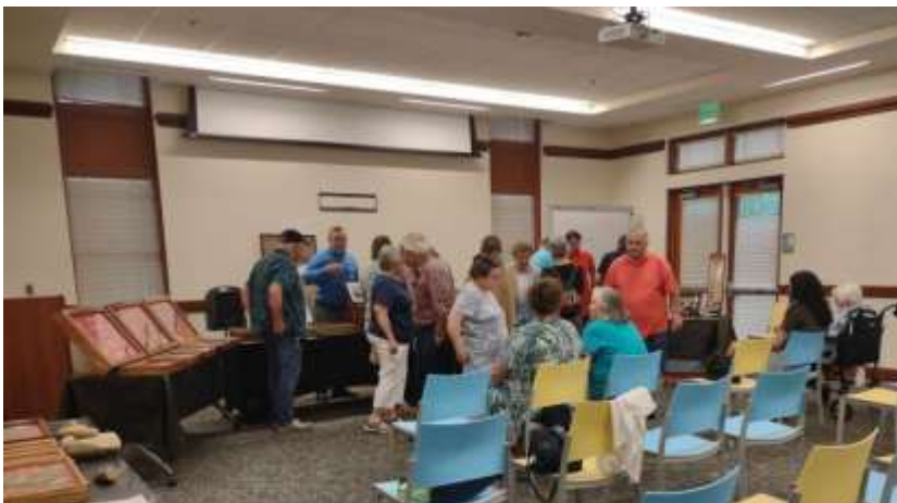
The audience examined items and asked questions.