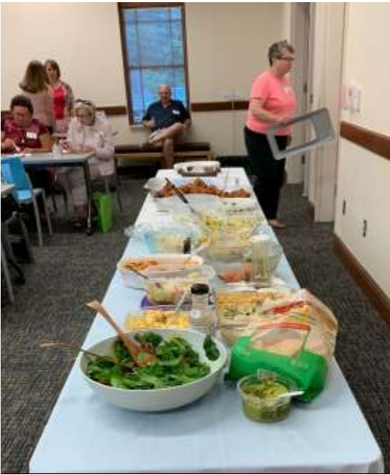
Getting ready, in times past...

Break out the cookbooks and get ready to celebrate summer, and another successful year for FOSFTL. Our annual June Social is scheduled for June 20th. Beginning at 6:30, members are invited to partake of fried chicken, courtesy of the Friends, along with side dishes and desserts prepared with pride in our members' kitchens. Plates, cups and utensils will be ready and waiting. We'll also take care of end-of-year business (new officers, etc.).