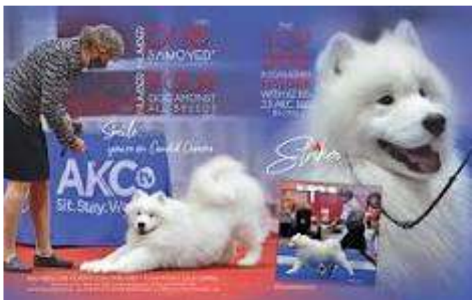
From Striker's official press kit...